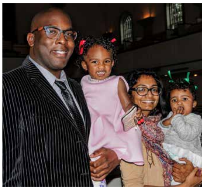
The Stewart family

"The savings will mostly likely go for additional funds for college for my girls. And possibly being able to continue to serve the community. Every Tuesday I do a community breakfast in Ward 8 in front of the library—those funds could help me expand the breakfast to serve more people in need."